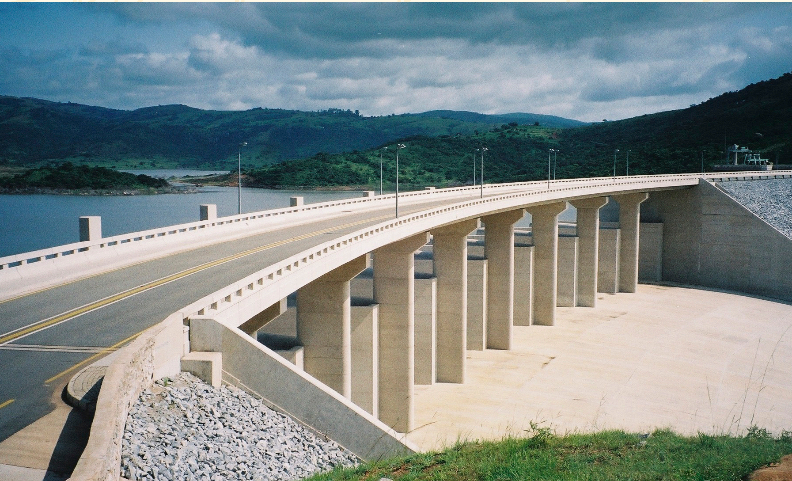
Maguga Dam, Swaziland Consultants: Maguga Dam Joint Ventures. Design Engineer: Pieter Louw

AutoBridge is seamlessly integrated with STRAP giving the user access to all options for processing and displaying results. Other load types, such as wind and seismic loads, may be defined on the same model and the results may be combined with the envelope generated by AutoBridge. The bridge may then be designed according to local steel and concrete codes.